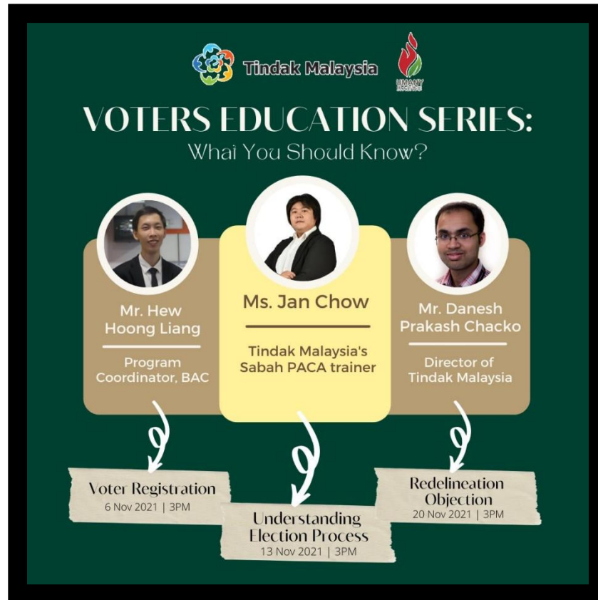
Picture 2: Tindak Malaysia - UMANY Voter Education Webinar Series Poster

Tindak Malaysia in collaboration with University of Malaya Association of New Youth (UMANY) jointly organized a webinar entitled Voter Education Series: What You Should Know. This webinar consisted of three separate sessions which was held from 6, 13 and 20 November 2021. The purpose of this webinar series was in view of the implementation of the UNDI 18 and automatic voter registration in January 2022 where the number of new voters aged between 18 and 20 is estimated to be increased by 1.3 million. Hence, this webinar was held in order to aid the new voters to be better prepared in fulfilling their obligations as a registered voter.