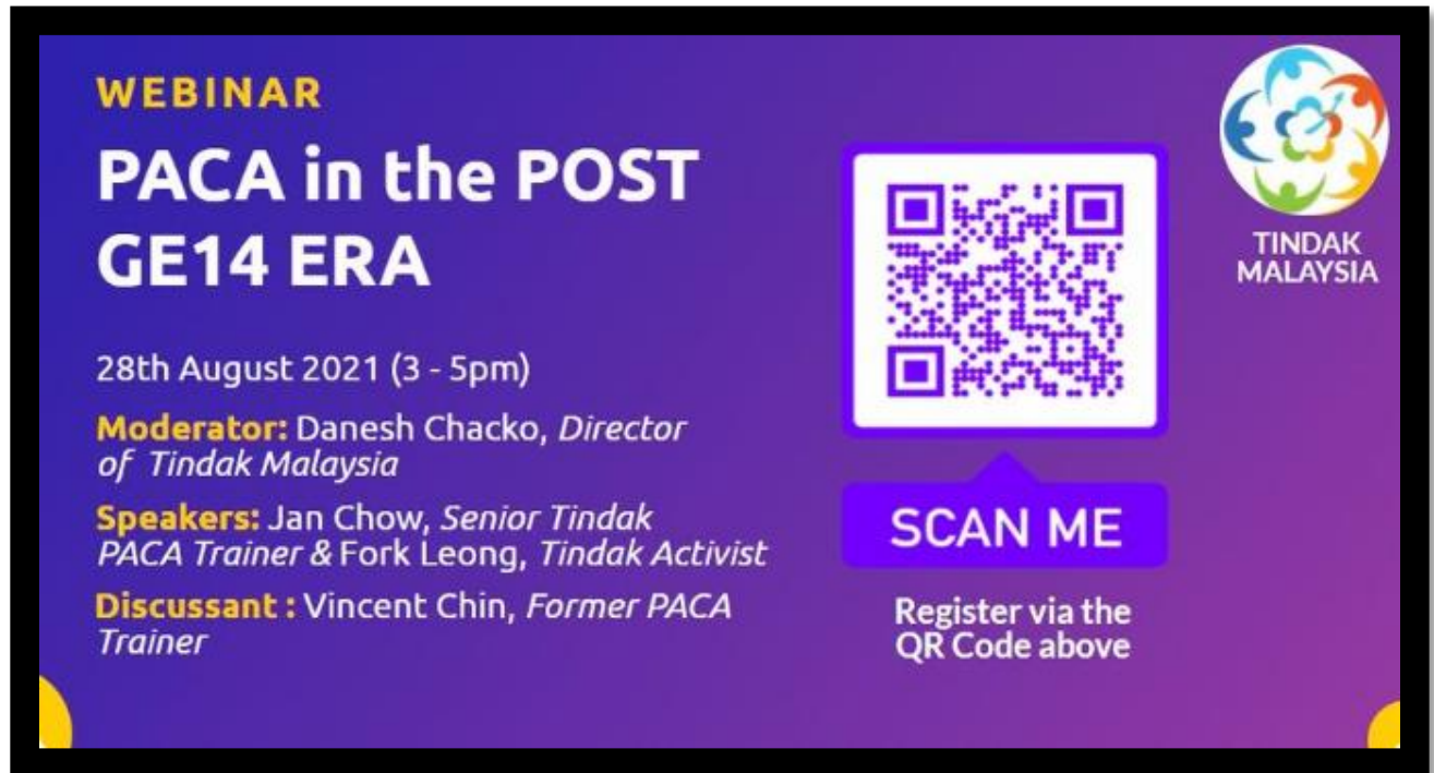
Picture 1: Webinar Poster of Tindak Malaysia's most popular webinar of 2021

In 2021, Tindak Malaysia organized six virtual public webinars on various topics regarding voter registration, the role of Polling Agents and Counting Agents (PACAs), the role of Redelineation Objectors and other topics of interest with the objective of promoting greater awareness among Malaysians about the electoral process in Malaysia. The speakers who participated in these public webinars consisted of Tindak Malaysia's pool of volunteers and also guest speakers who were invited by Tindak Malaysia.