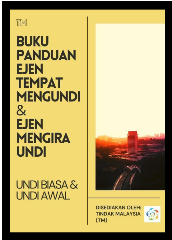
Picture 3: Cover of the Buku Panduan Ejen Tempat Mengundi dan Ejen Mengira Undi